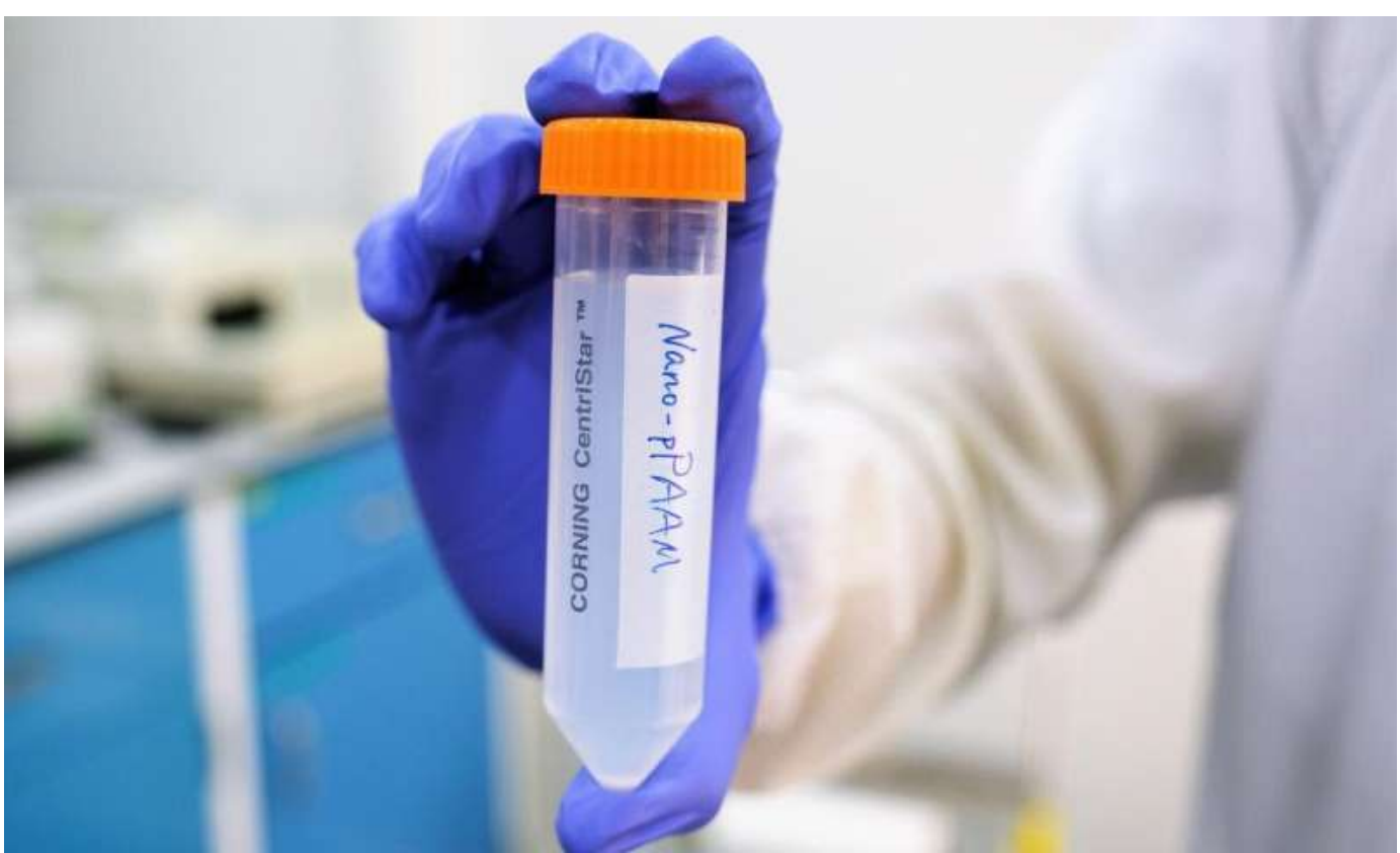
The anti-cancer therapeutic nanoparticle is ultrasmall, with a diameter of 30 nanometres, or approximately 30,000 times smaller than a strand of human hair, and is named Nano-pPAAM.

As a proof of concept, the scientists tested the efficacy of Nano-pPAAM in the lab and in mice and found that the nanoparticle killed about 80 per cent of breast, skin, and gastric cancer cells, which is comparable to conventional chemotherapeutic drugs like Cisplatin. Tumor growth in mice with human triple negative breast cancer cells was also significantly reduced compared to control models.