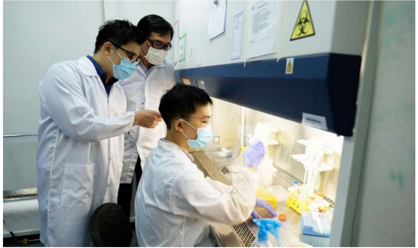
In lab tests, the scientists found that Nano-pPAAM killed about 80 per cent of breast, skin, and gastric cancer cells, which is comparable to conventional chemotherapeutic drugs like Cisplatin.

The anti-cancer therapeutic nanoparticle is ultrasmall, with a diameter of 30 nanometres, or approximately 30,000 times smaller than a strand of human hair, and is named "Nanoscopic phenylalanine <u>Porous Amino Acid Mimic</u>", or Nano-pPAAM,